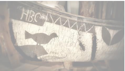
"2016/366/120 Uber Canuck"

Compare daily life during the fur trade to life today by examining at least 3 of the following areas: work, tools/technology, transportation, food, clothing, housing, entertainment, health/sickness or other. When you have finished your comparison notes in the table, write a summary statement following the sentence starter at the bottom of the page.